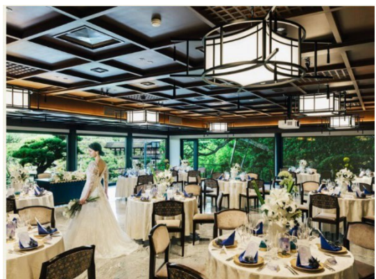
Heian-Jingu Shrine Hall and Room for Reception