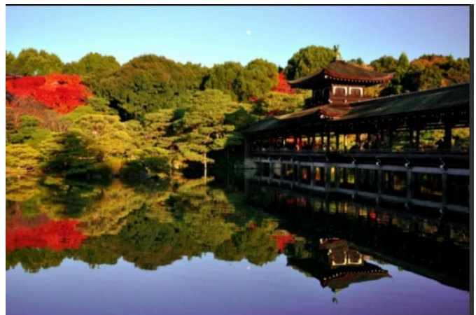
Garden in front of reception building below