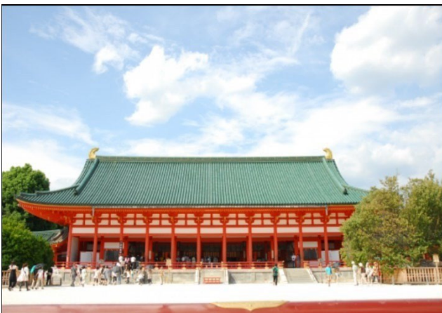
Front Gate of Heian-Jingu Shrine